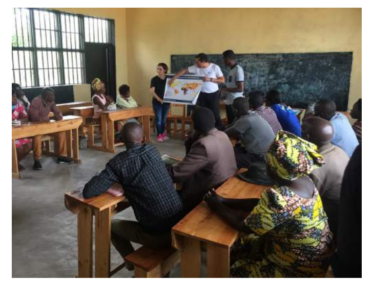
Presentation of the map showing the respect of children's rights to 21 local leaders in Ntongwe, Ruhango (local authorities and teachers)

23 years after the genocide, Rwandan family life is being rebuilt. However, the traumatic experiences lived by these children now turned parents are profound and their recovery rests on fragile foundations. Through its innovative workshops, Humanium trains its local partners to promote social healing and raises the population's awareness of the rights of the child.